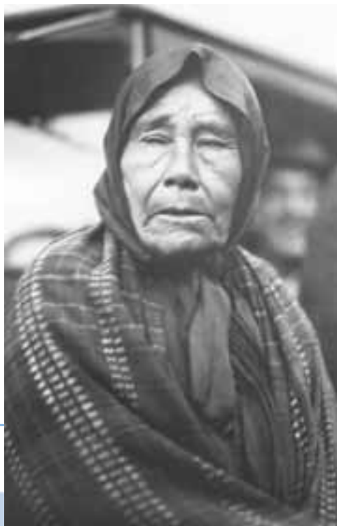
First Nations woman at St. Albert, Alberta July 1929

who were the first settlers in St. Albert. The traditional colours of Britain – red, white and blue – symbolize the many anglophones who contributed to the expansion of the community."