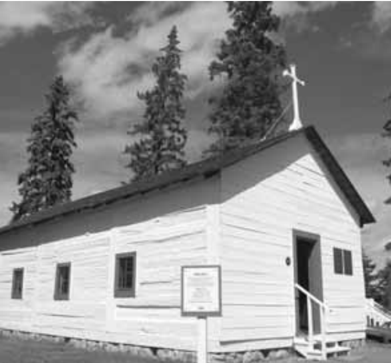
Opened in 1948, the Little White School is now a heritage site that takes visitors back to the early days of a two-room school house near the banks of the Sturgeon River.