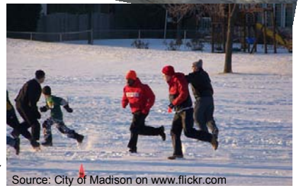
A Green is a larger open space that would include playing fields or dog parks.