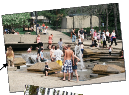
A Plaza is a smaller urban style civic space with primarily hard surfaces and surrounded on two or three sides by buildings. It would have a variety of uses and activities