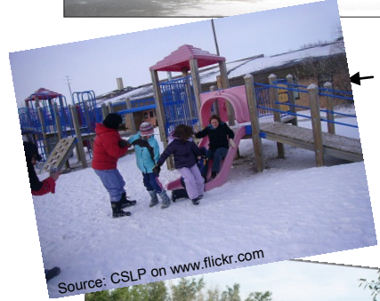
A playground could be found in any of the civic spaces, but it could be part of a small neighbourhood Pocket Park .