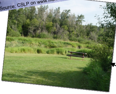
A Natural Area may be preserved for minimal use, if it's a sensitive area, or partially developed for informal uses in certain areas.