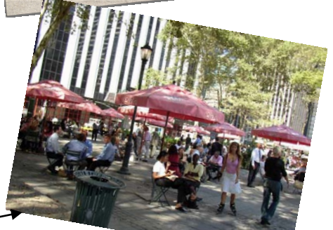
A Square is a larger urban style park with a mix of hard and soft surfaces and a variety of amenities and potential activities. It's generally surrounded on most sides by streets.