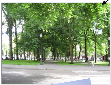
The Parkway is a specialized linear park running the full length of a select street with a mixture of hard and soft surfaces and variety of activities.

Currently , parks are the only identified Civic Space and a permitted use in some districts of the current Land Use Bylaw. Civic spaces are broader than just parks, and Form-based zoning identifies six different types of civic spaces that could be used in the framework of the public realm, suitable for different types of development.