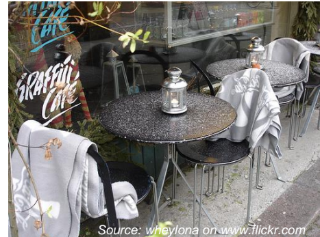
An outdoor café in Sweden provides a 'warm' touch for customers