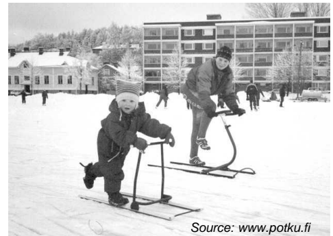
Kicksledding in Finland gets all ages out enjoying winter weather